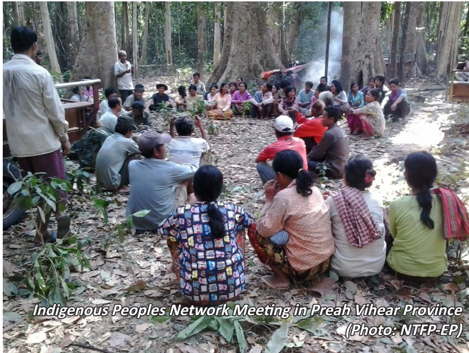
Indigenous Peoples Network Meeting in Preah Vihear Province